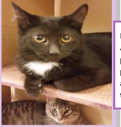
Elmer and Autumn posing for potential adopters at the cannery

the Cat Cannery offering exposure of our cat population that grew to over 70 cats this summer. By the end of 2016, our cat population had been reduced to nearly half. Hope volunteers clean the cannery weekly and PetSmart employees take care of their daily needs with food, water, and litter box cleaning.